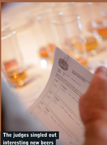
The judges singled out interesting new beers

Nail Brown Ale Okells Aile Okells Mac Lir Perla Purple Moose Dark Side of the Moose Quantock Stout Redoak Porter Robinson's Ginger Tom Sagres Bohemia Samuel Adams American Kriek Samuel Adams Brown Ale Samuel Adams Chocolate Bock Samuel Adams Cream Stout Samuel Adams Holiday Porter Samuel Adams Imperial White Samuel Adams Irish Red Samuel Adams Latitude 48 Samuel Adams Latitude 48 Ahtanum Samuel Adams Latitude 48 Hallertau Mittelfruh Samuel Adams Latitude 48 Zeus Samuel Adams Old Fezziwig Ale Samuel Adams Pale Ale Samuel Adams Rustic Saison Samuel Adams Summer Ale Samuel Adams Triple Bock Samuel Adams White Ale Schöfferhofer Hefeweizen Sharp's Doom Bar Sharp's Monsieur Rock Shepherd Neame Bishops Finger Statalenove Kristal Statalenove Miss Kartola Statalenove Ponente Stoke Dark Super Bock Classic Thornbridge Bracia Thornbridge Jaipur Tongerlo Prior Turbacci Super Valscura Fich Valscura Matrimoniale Viru Waldhaus Diplom Pils Waldhaus Special Gold Weihenstephaner Hefeweiss Williams Seven Giraffes Williams Ceilidh Worthington's White Shield